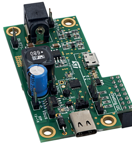
Source PD controller with DC/DC evaluation board, Order code: STEVAL-ISC003V1

For multi-port applications, an I 2 C interface allows the connection of multiple STUSB47 ICs to an MCU to implement power-sharing algorithms.